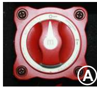
FIG. 1A Off