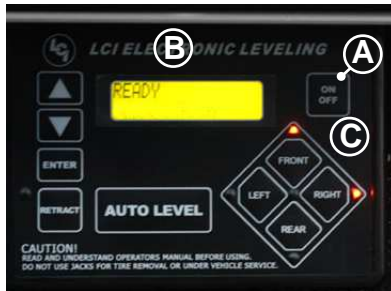
FIG. 2 - Touch Panel