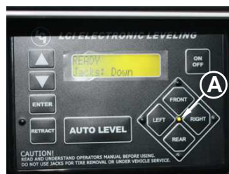
FIG. 3 Touch Panel - Unit Level