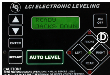
Fig. 3 Touch Panel - Unit Level