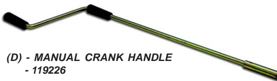
(D) - MANUAL CRANK HANDLE - 119226