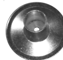
(A) - FOOT PAD